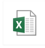
V-SOP Master4-Sofo.xlsx Yesterday at 10:38 AM